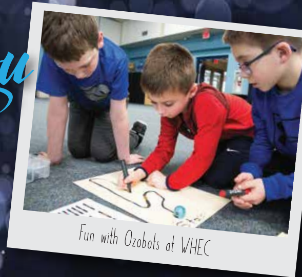
Fun with Ozobots at WHEC